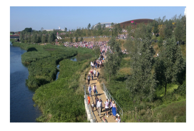
Sports and Urban Biodiversity Guidelines