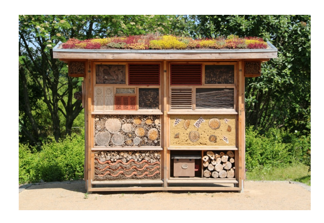
A guide for pollinator-friendly cities