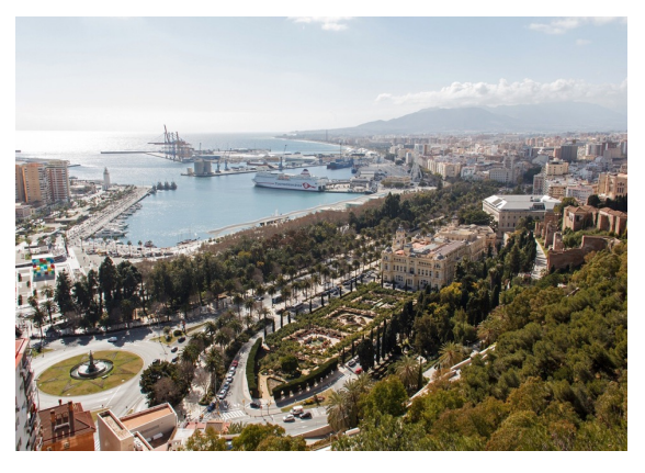
Planning and delivering Nature-based Solutions in Mediterranean cities