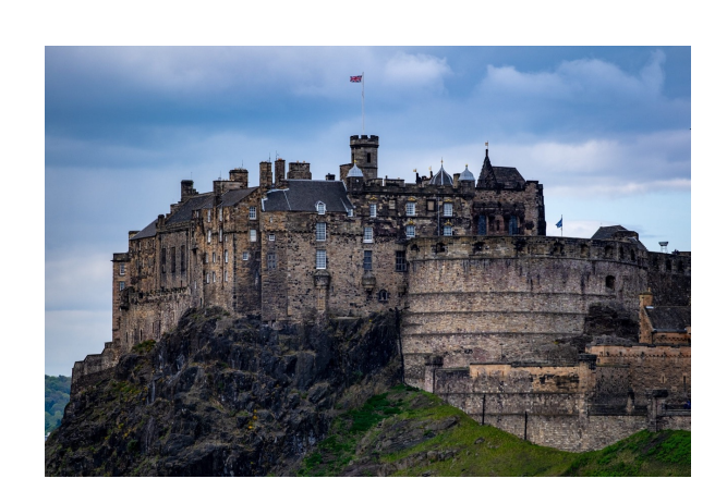
Historic Urban Landscape Approach