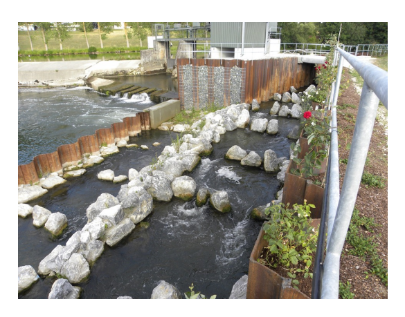
Guidelines for conserving connectivity through ecological networks and corridors