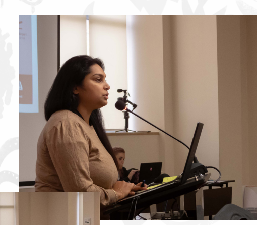
"Availability of information"