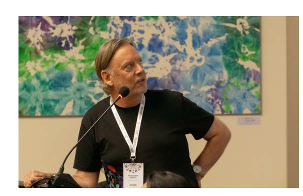
"Meeting new people and new organisations"