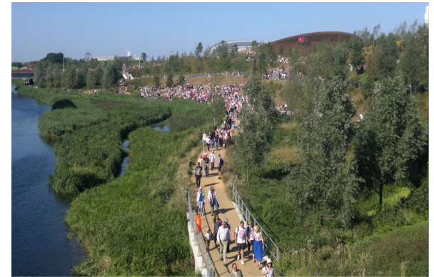
Sports and Urban Biodiversity Guidelines