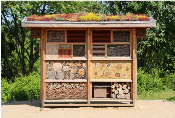
A guide for pollinator-friendly cities