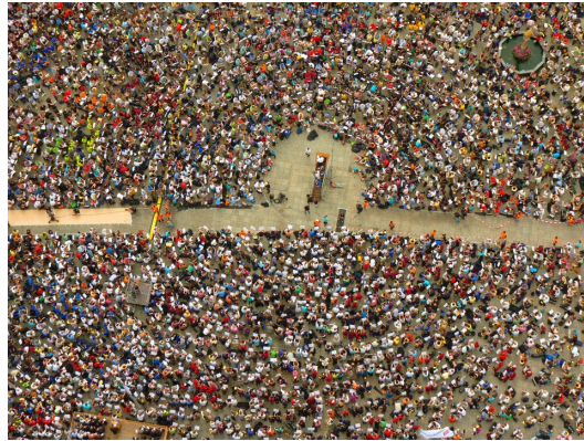
Climate Justice for People and Nature