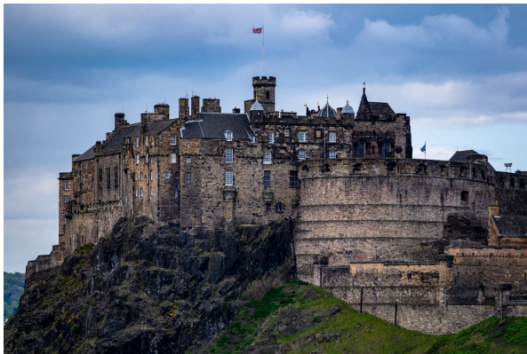
Historic Urban Landscape Approach