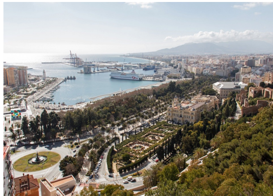
Planning and delivering Nature-based Solutions in Mediterranean cities