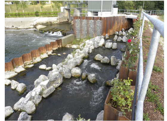
Guidelines for conserving connectivity through ecological networks and corridors