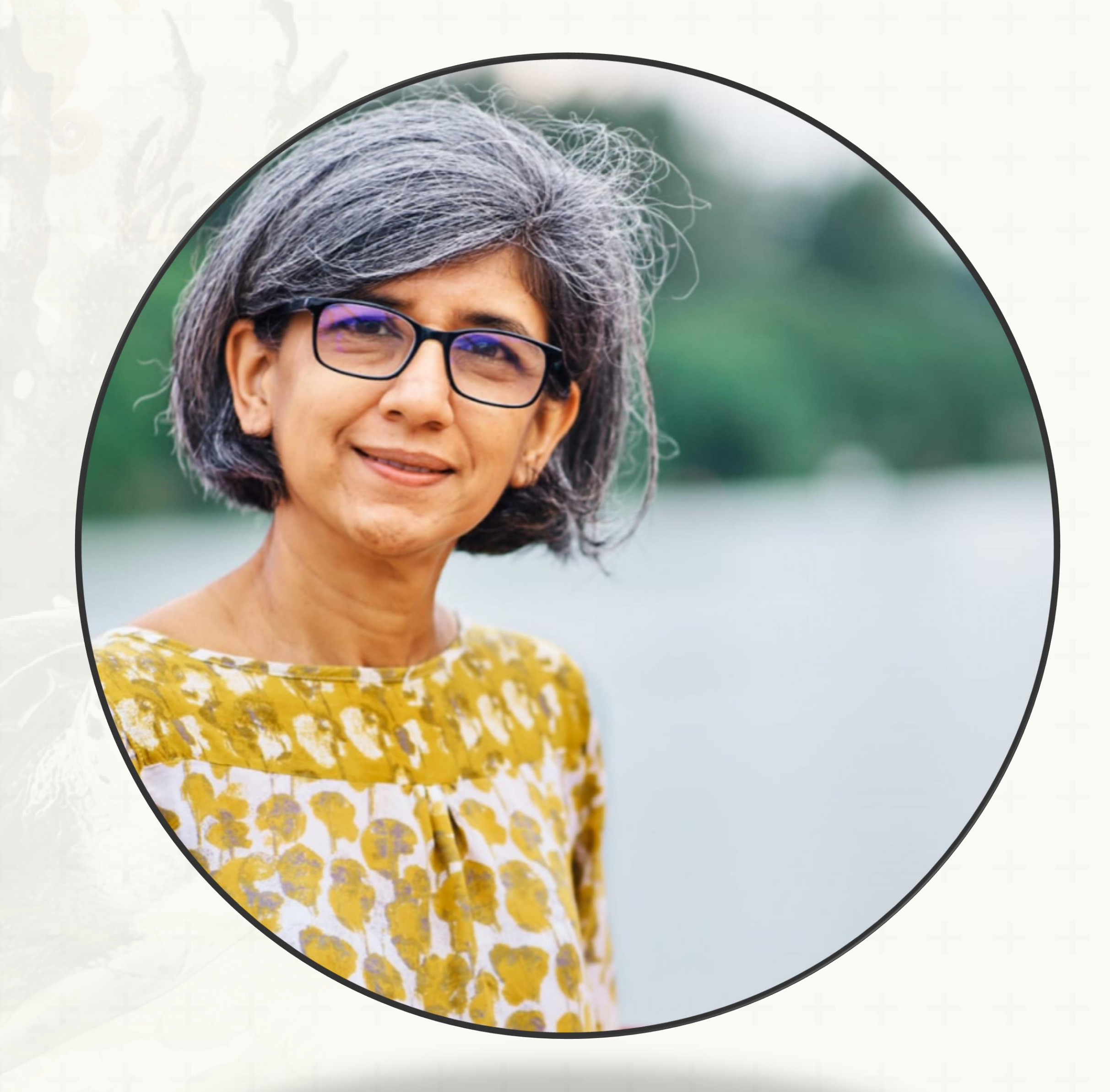
Forename Surname Position, Organization