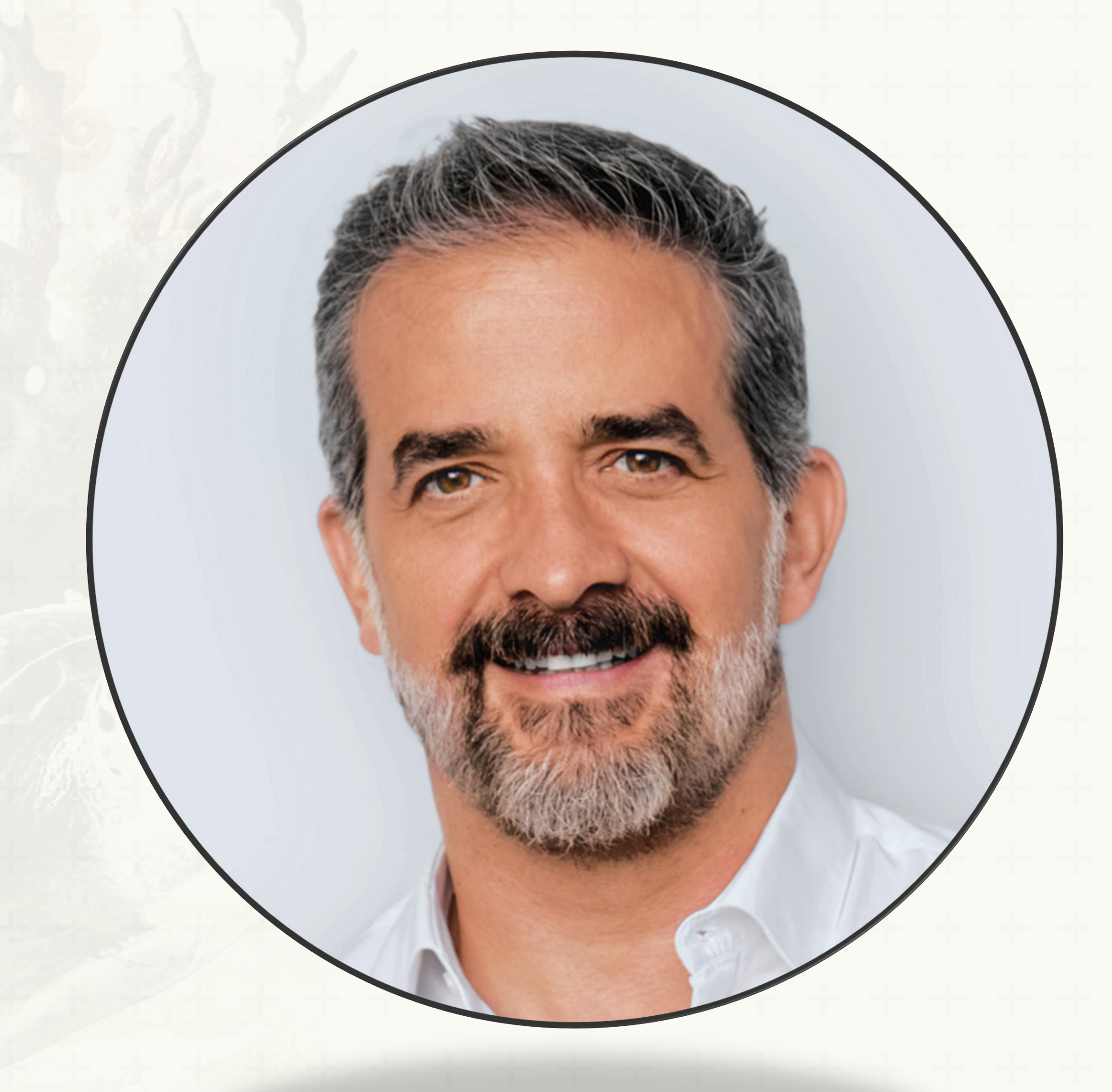
Forename Surname Position, Organization