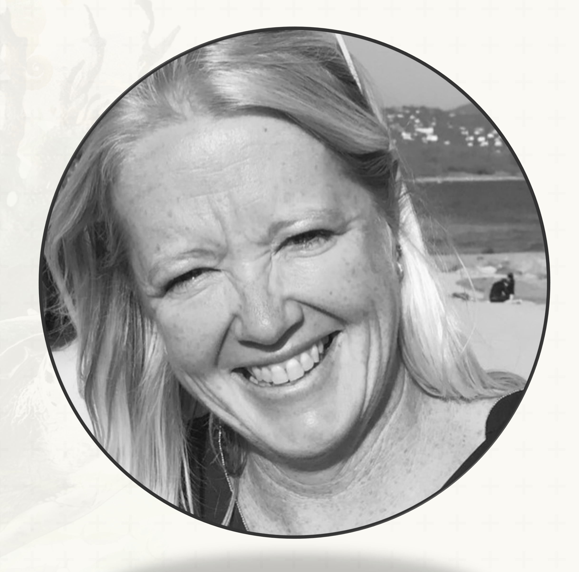
Forename Surname Position, Organization